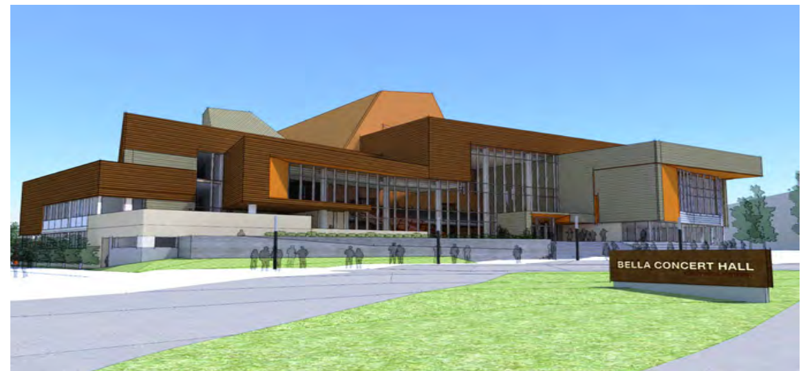
North Glenmore Park, "NEWS"